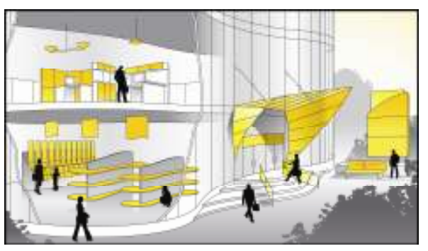
SEE LARGER IMAGE ON FUTURE PAGES

ACRYLIC BRAND NAMES – PLEXIGLAS<sup>®</sup>, LUCITE<sup>®</sup>, ACRYLITE<sup>®</sup> ACRYLIC MANUFACTURERS - POLYCAST, CYRO, ARKEMA, PLASKOLITE