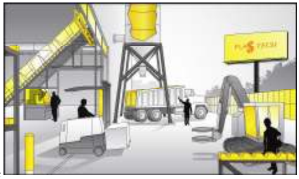
SEE LARGER IMAGE ON FUTURE PAGES

ACRYLIC BRAND NAMES – PLEXIGLAS<sup>®</sup>, LUCITE<sup>®</sup>, ACRYLITE<sup>®</sup> ACRYLIC MANUFACTURERS - POLYCAST, CYRO, ARKEMA, PLASKOLITE