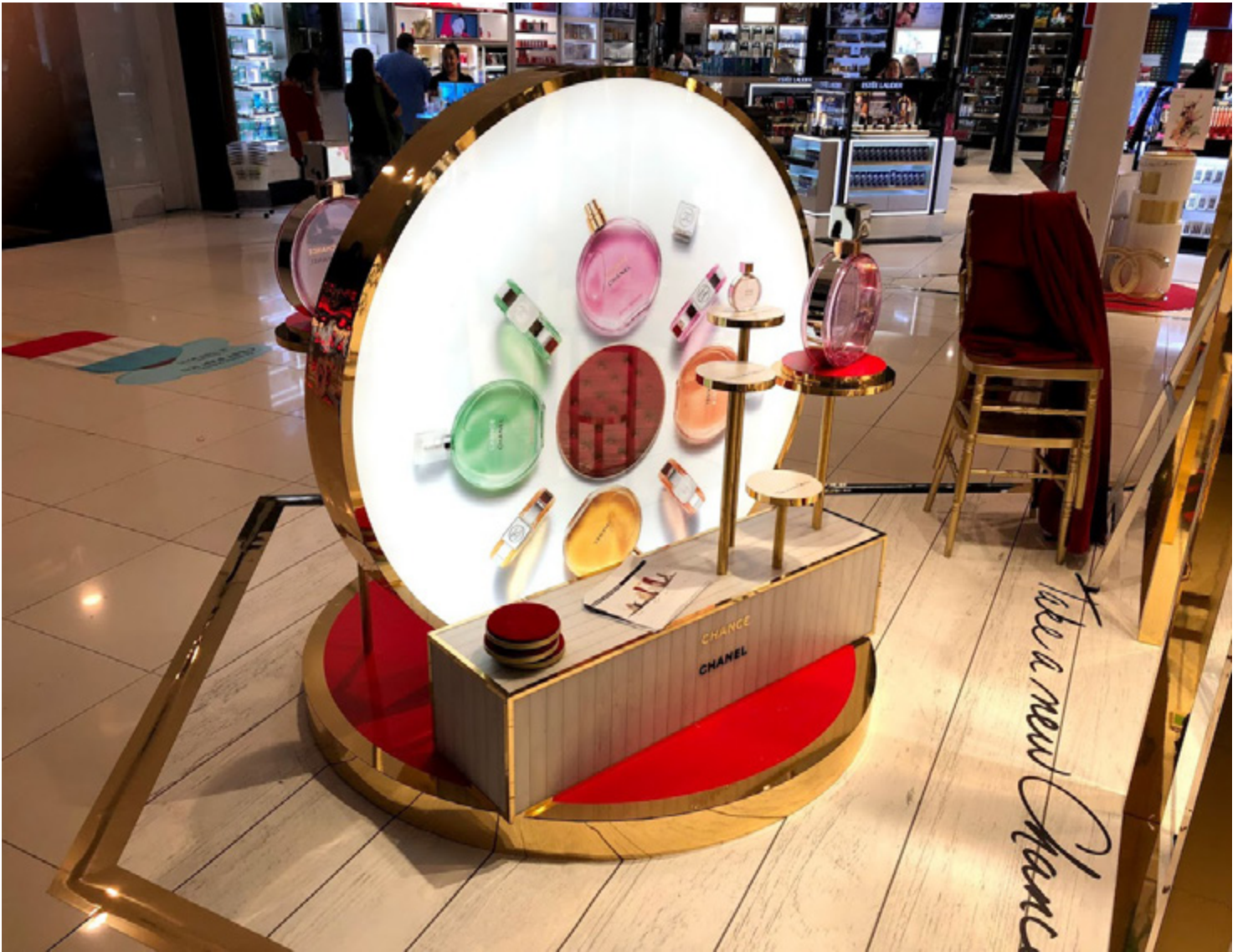
Chanel: Retail Pop Up Space