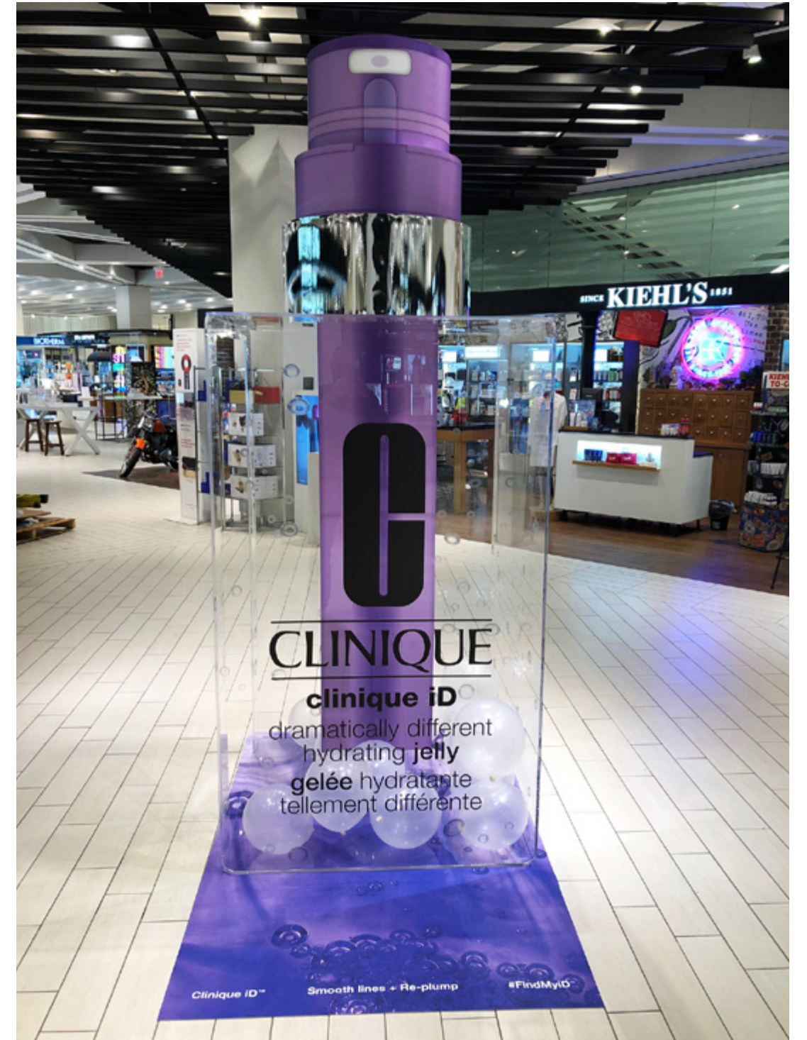
LEFT Louboutin: Store Front Display Dolce & Gabbana: Retail Outpost RIGHT Clinique: Experiential Marketing