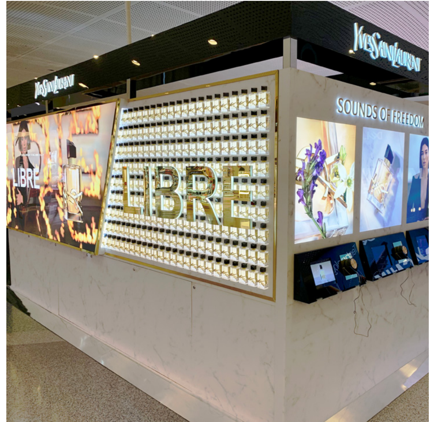
Armani: Cosmetic Station Jean Paul Gaultier: Experiential Marketing Yves Saint. Laurent: Retail Pop Up Store