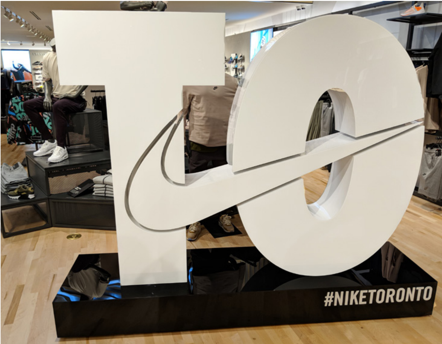
Nike TO: Experiential Marketing