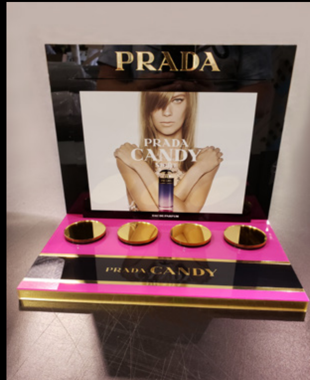
Prada: Point of Purchase Display

We specialize in plastic fabrication however we also work with wood, foam, metal and aluminum. Our wide variety of in-house fabrication services, laser cutting and direct print capabilities makes Plas-Tech the perfect partner for your large and small volume point of purchase display needs.