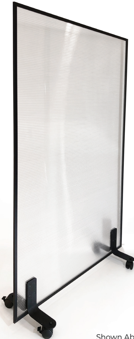
Shown Above: Clear

The Portable Barrier Wall for Covid-19 Mitigation